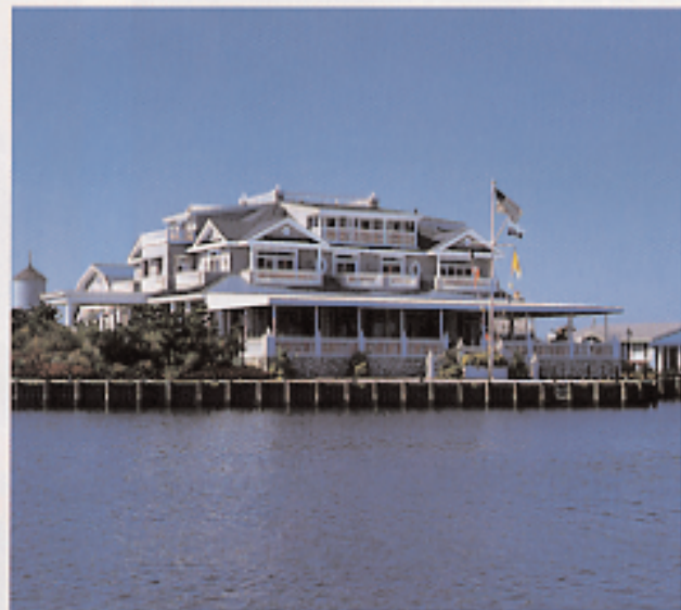
CONCEPT AND DESIGN BY MICHELLE RAGO