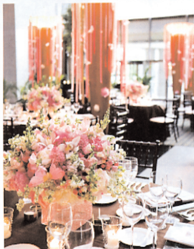
Above: Floral-covered ribbons hanging from light fixtures are offset by low centerpieces of peonies in various shades of pink. The arrangements, set in paper-wrapped glass vases, are adorned with silk butterflies.