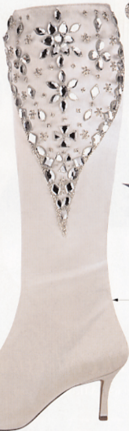
4 SNOW BOOTS White silk satin boots with Swarovski crystals, $1,500, by Vanessa Noel